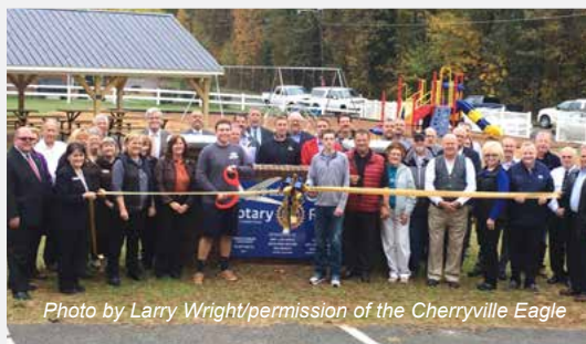
Ribbon Cutting of the Cherryville Rotary Park, funded in 2014