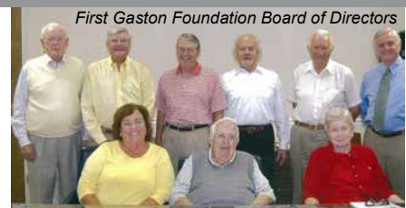
First Gaston Foundation Board of Directors