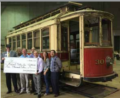
Check Presentation to Belmont Trolley, Inc.