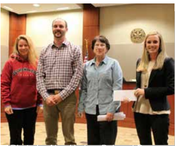
Check presentation to Mount Holly Community Development Foundation

*2015 grants will be awarded by January 2016